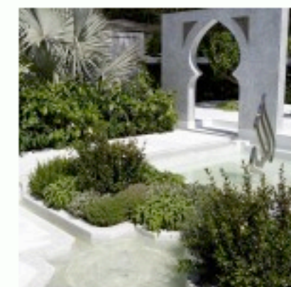
The Beauty of Islam